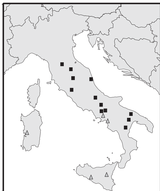
Fig. 1. Location of the study area and positions of the rain gauge stations using for analysis (squares) and for validation (triangles).

along the coastal zones, changing to almost continental conditions inland, so that a dry summer period is followed by maximum rainfall in the mid-autumn and a gradual lessening of rainfall in autumn and spring. Although there are extreme rainfall events in winter, stormy events with the highest hourly and half-hourly intensities occur between May and September (Diodato, 1999). In this study, twelve