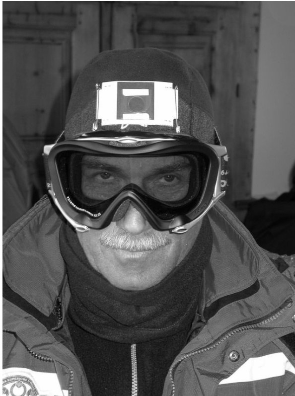
Fig. 1. Instructor, dosimeter attached to the cap.