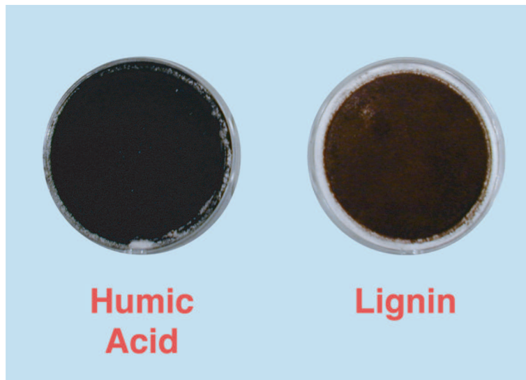
Fig. 2. Filters loaded with commercial samples of humic acid (Fluka 53680) and lignin (Aldrich 37,095-9).