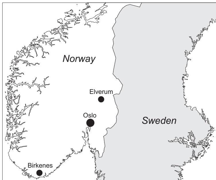
Fig. 1. Map of the southern parts of Norway including the location of the sampling sites Birkenes (rural background), Elverum (suburban), and Oslo (curbside and urban background).