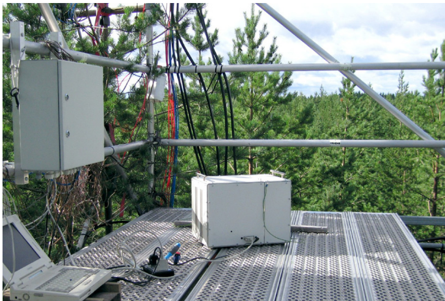
Fig. 1. BSMA2 (in the center of the picture) between pine tops.