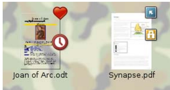
Figure 2 Two documents with smart icons

The interest of smart icons is to convey to the user as much as possible information about the objects they represent, in a clear and non-intrusive way.