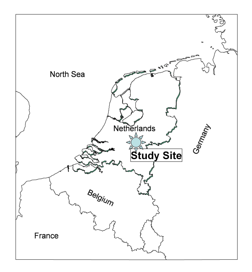
Fig. 1. Location of the study area in Waterboard Rivierenland.