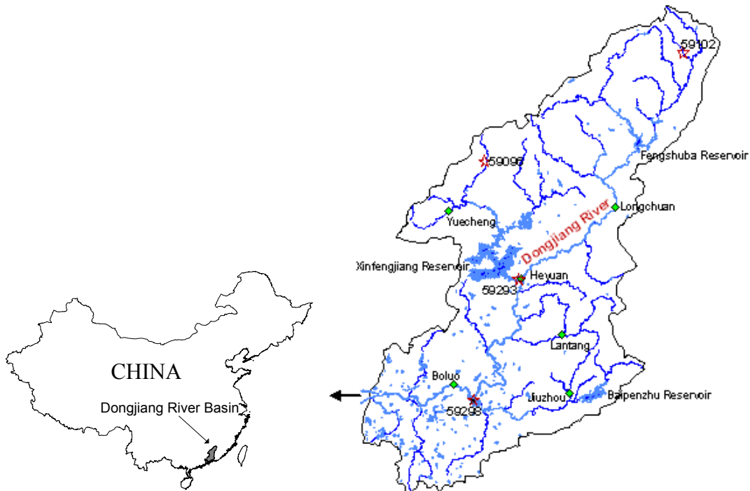
Fig. 1. Location of the study area (left) and locations of gauging stations (right).