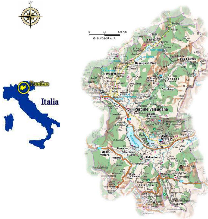
Fig. 1. Map of Trentino, a northern Italian province and of Alta Valsugana, an alpine valley of Trentino.