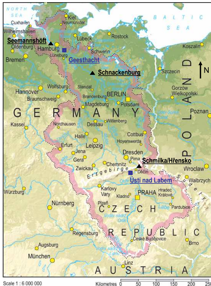
Fig. 2. Elbe river basin with main gauging stations (triangles) and fish passes (squares) (based on http://www.grid.unep.ch/product/publication/freshwater_europe/images/map9.jpg (24 April 2007)).