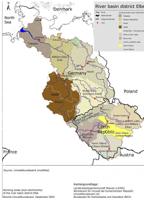
Fig. 3. The Elbe basin.