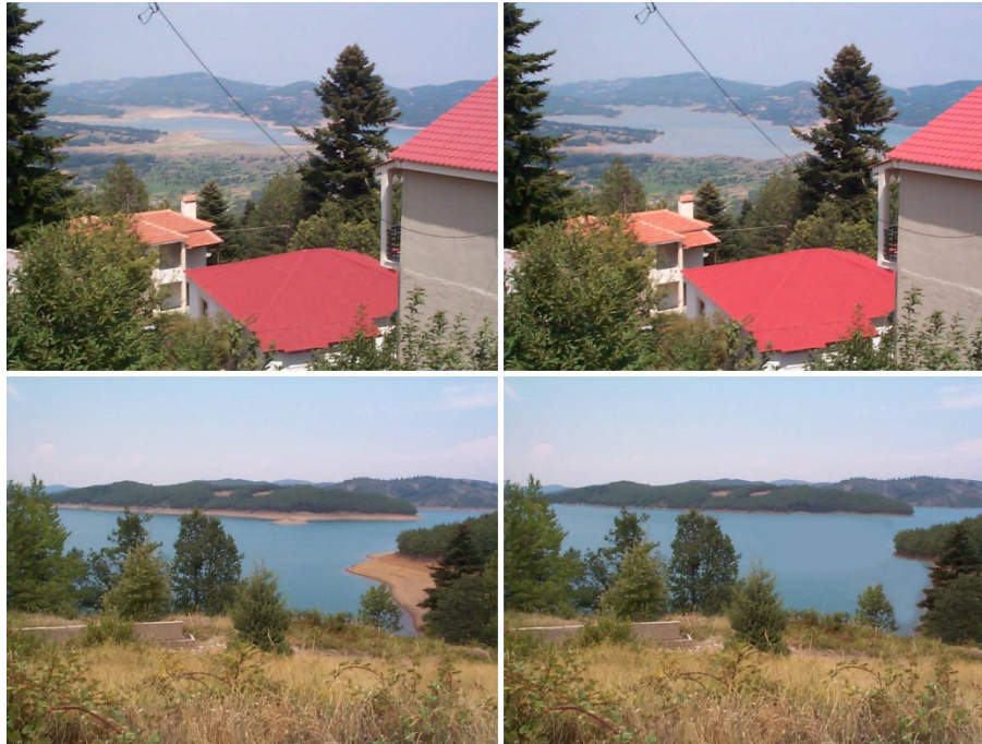
Fig. 3. The transition area. The photographs on the left have been taken on the north and south part of the lake when its level was 781.3 m. On the right the same photographs are digitally processed to show how the landscape would be if the lake were full.