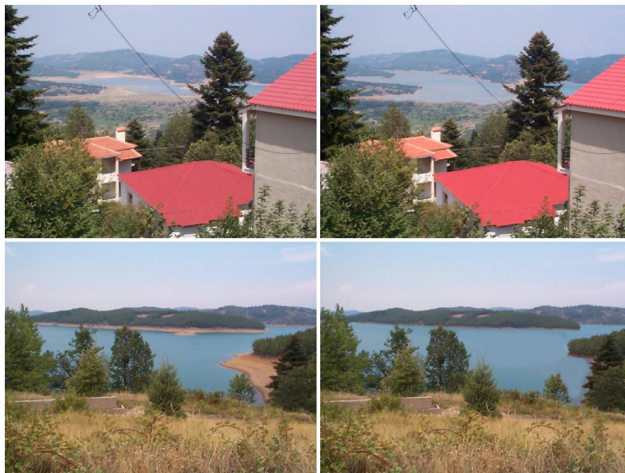
Fig. 3. The transition area. The photographs on the left have been taken on the north and south part of the lake when its level was 781.3 m. On the right the same photographs are digitally processed to show how the landscape would be if the lake were full.