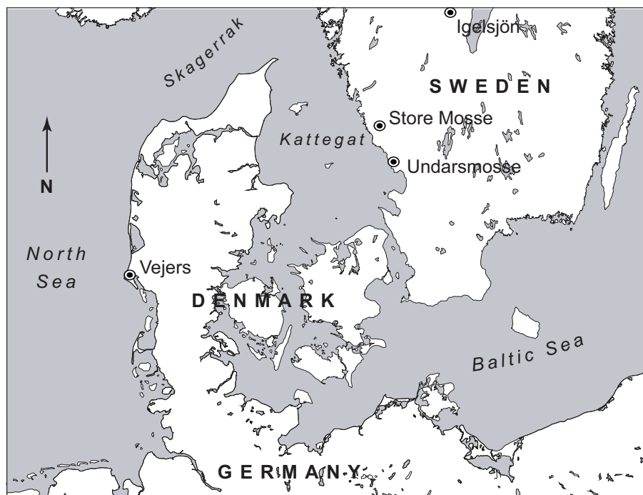
Fig. 1. Map showing the location of the Undarsmossen bog on the south-west coast of Sweden. The locations of three other sites (Store mosse bog, Vejers dunefield, lake Igelsjön) mentioned in the text are also shown.