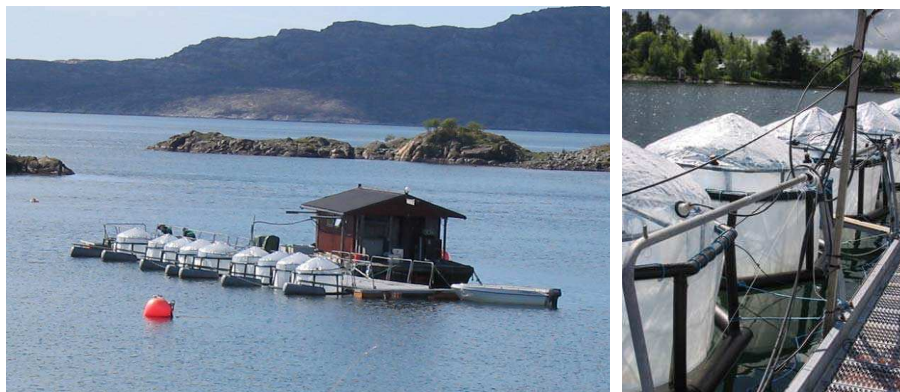
Fig. 1. PeECE III experimental set-up at Large-Scale Mesocosm Facility of the University of Bergen in Espesrend, Norway. Left: array of 9 mesocosms in front of the floating raft. Right: Mesocosm enclosures were covered by gas-tight tents made of ETFE (ethylene tetrafluoroethylene) foil, which allowed for 95% light transmission of the complete spectrum of sunlight, including UVA and UVB.