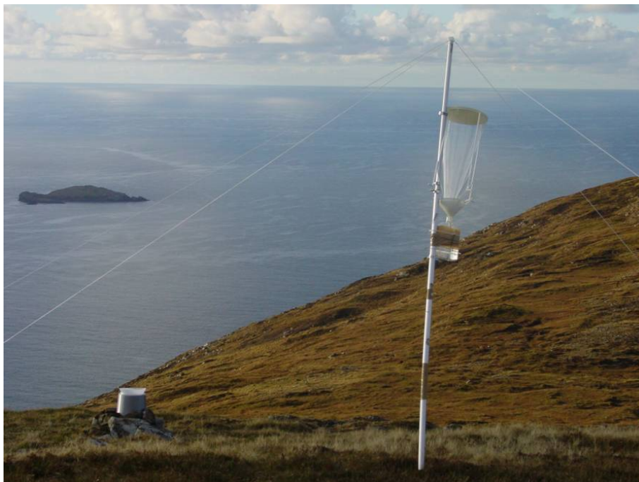
Fig. 1. Cloud collector set up on Caepabhal. Collector was erected onto the end of a 2 m pole and secured with guy ropes.