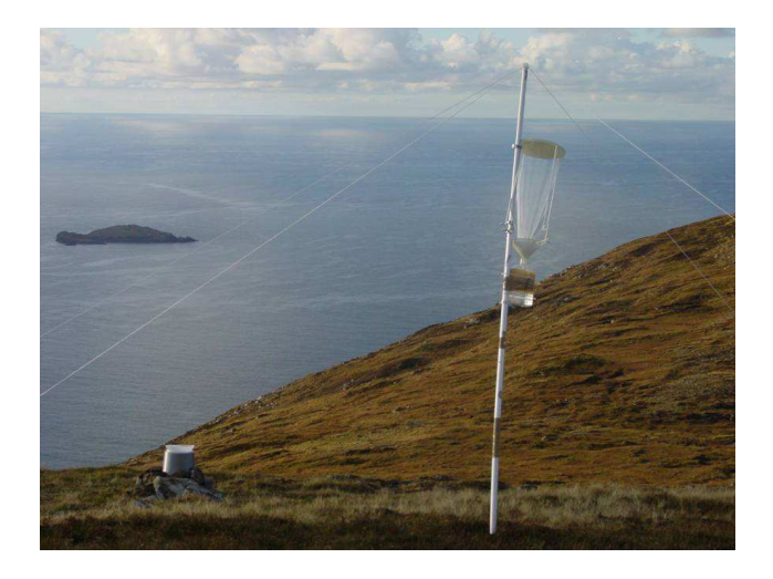
Fig. 1. Cloud collector set up on Caepabhal. Collector was erected onto the end of a 2 m pole and secured with guy ropes.

residents, having adapted to exploit this diffuse but vast environmental niche. That is, are they scavenging nutrients from cloud water and using wind and rain for dispersal? In particular, the role of some species of bacteria with heterogeneous ice nucleation ability may be highly significant in raindrop formation (Morris et al.; 2005 and Vali, 1996).