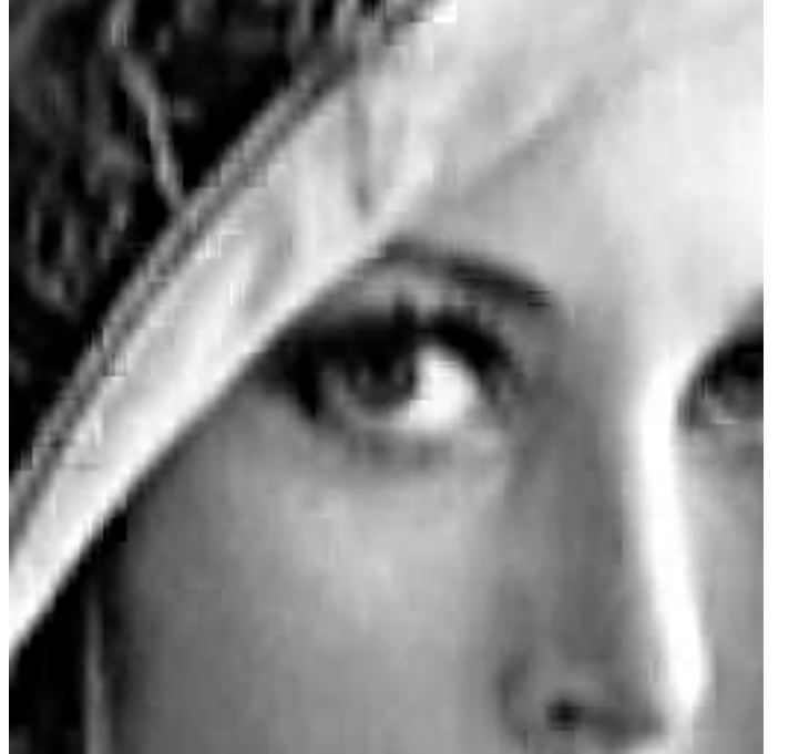
Fig. 2. 4 times interpolation on a detail of Lena: bicubic (up), regularity-based (bottom)