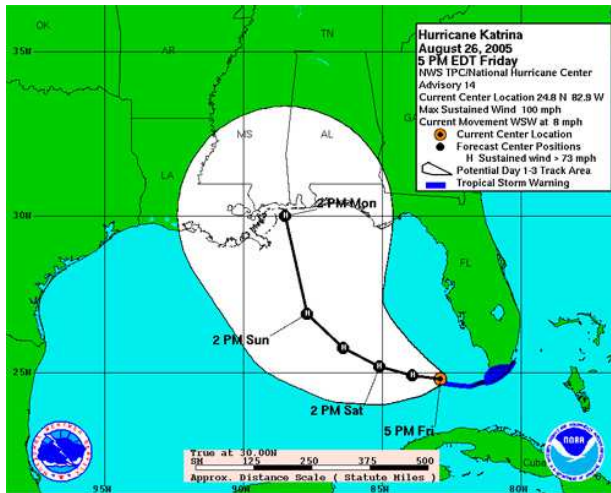
Fig. 3. From National Hurricane Center, 26 August 2005.

much of it is below sea level and is protected from flooding by levees. It has been well known for a few decades that the levees were in need of repair. Hurricane Georges in 1998 almost hit New Orleans, but at the last moment it veered to the right of the city.