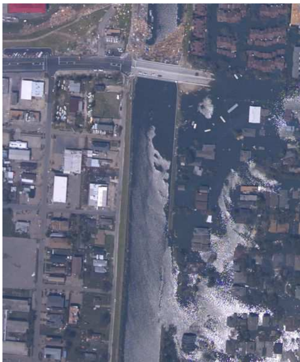
Fig. 5. Breach in 17th St. Canal in New Orleans, LA, 31 August 2005.

if they did find a place to go. Another possible consideration by some who chose not to leave the at-risk coastal areas is that there had been false alarms and calls for evacuations when past hurricanes failed to make landfall. To some Katrina victims, their assumption might have been that this was just another hurricane forecast with a low probability of actually hitting New Orleans.