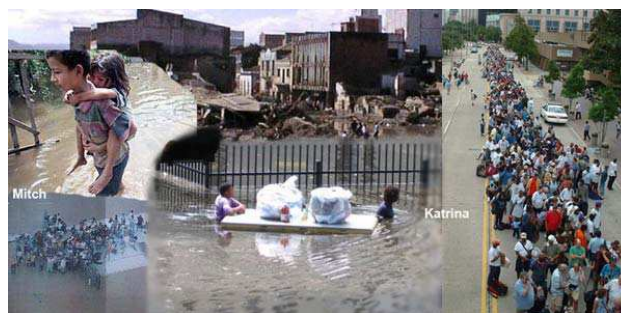
Fig. 6. Composite of refugees from Hurricanes Mitch and Katrina (public domain images prepared by CCB).

Once Katrina made landfall, those who remained trapped inside the city eventually had to seek refuge wherever they could. An estimated 25 000 refugees ended up living for several days in the Louisiana Superdome, with no amenities such as toilet paper, soap, diapers, clean clothes, wash facilities and a scarcity of bottled water. Rumors seem to rule media coverage. There were unsubstantiated but broadcasted rumors of people firing guns at rescue helicopters, for example, and allegations of rape occurring in the Superdome. There was considerable finger-pointing by politicians and bureaucrats trying to avoid blame for the ineffective response to the impacts of the hurricane. Frustrated newsmen on TV lost their composure and neutral commentary in favor of blaming the government for its poor response time and inadequate assistance to disaster victims.