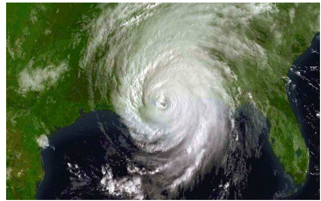
Fig. 4. This image was taken by NOAA's Geostationary Operational Environmental Satellite or GOES.

One can effectively argue that a Category 3 hurricane would eventually make landfall at or near the New Orleans metropolitan area. Government planners from local to national levels should have foreseen the impacts associated with a hurricane making landfall at or near New Orleans. This observation is not rocket science. It is just common sense to expect landfall, something that seemed to have been missing in the years leading up to August 29, 2005, when Katrina made landfall. Hurricane Pam, discussed below, was a belated recognition of the need to consider a worst-case scenario for impacts of a hurricane striking New Orleans head-on.