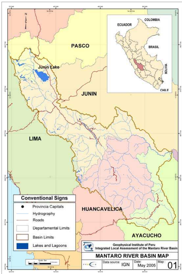
Fig. 1. Mantaro River Basin map.