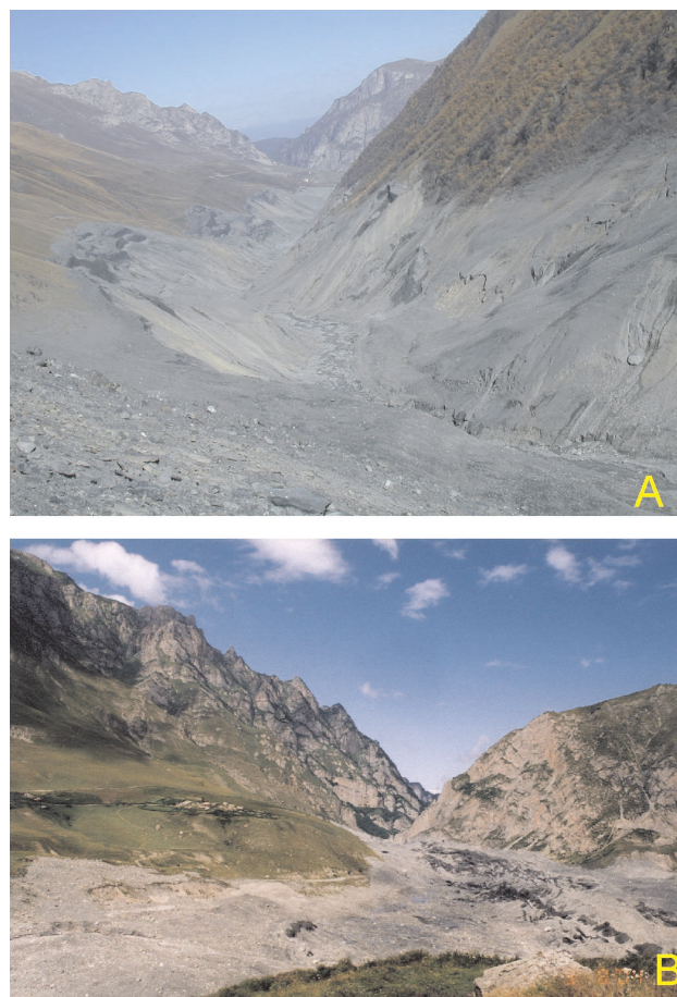
Fig. 2. (A) travel path of the Kolka-Karmadon glacier avalanche flow. (B) Karmadon depression filled by debris-covered ice, two years after the disaster.

During the second and main stage of the movement, the ice/water/rock mass moved from one valley side to the other within a belt 400–500 m wide. The moving mass left asymmetric superelevations up to 250 m in height (Fig. 2a). A