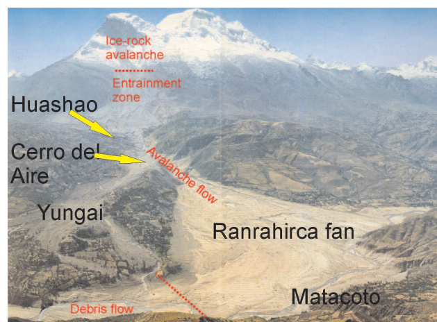
Fig. 3. Huascarán glacier disaster of 31 May 1970: typical case of a glacial multi-phase mass movement. Photo by W. Welsch (from Patzelt, 1983).

The Parraguirre event began as a rockslide with a volume of 6 Mm 3 and the process quickly transformed into a rock avalanche (Casassa and Marangunic, 1993; Hauser, 2002). Within 5 km from its source the avalanche developed into a great debris flow due to incorporation of glacier ice and