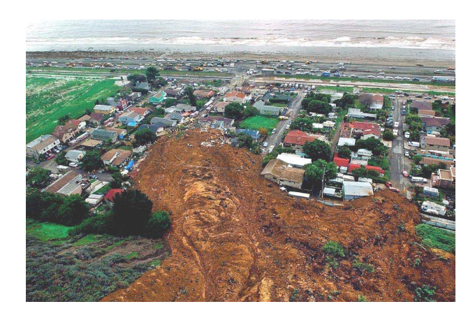
Fig. 3. Landslide at La Conchita, Ventura, California, on 10 January 2005, destroyed 13 houses, severely damaged 23 others, and killed 10 people (Jibson, 2005).

Models help scientists address the complexity of landslide occurrence and behavior, for example at La Conchita in Ventura, California (Fig. 3). In 1995, a landslide consisting of a relatively coherent block of earth at La Conchita caused property damage but no fatalities. Ten years later, another landslide remobilized from the 1995 deposit, transformed rapidly into a highly fluid debris flow, and traveled downslope at a speed of 5 to 10 \,\mathrm{m\,s^{-1}} , causing 10 fatalities (Jibson, 2005). Landslide models can serve as useful tools for officials charged with public safety, by allowing the officials to estimate the changes in slope stability that might occur under varying rainfall, land use, and other scenarios. The models use a combination of geologic, topographic, hydrologic, geotechnical, and land use/land cover factors to estimate the probability of hillslope failure. Scientists use locally- to regionally-derived data to calibrate the landslide models, which are then used to predict where, and under what conditions, landslides are likely to occur.