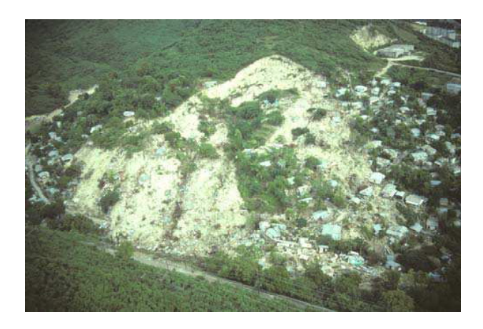
Fig. 1. Aerial view of Barrio Mameyes, Ponce, Puerto Rico, following October 7, 1985 landslide disaster (Jibson, 1989). Before the landslide, the area of exposed bedrock in the center of the photograph had a comparable density of small one-story houses as is seen on right side of photograph.

of rainfall-triggered landslide disasters in Puerto Rico and Venezuela where anthropogenic factors were significant, and discusses approaches for hazard mitigation.