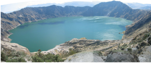
Fig. 1. Caldera Lake Quilotoa, Ecuador.

be pointed out that lakes in volcanic active areas, especially of caldera lakes, have a high risk of eruption.