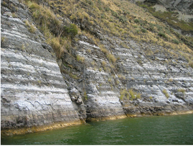
Fig. 3. Progressive decreases in water level at Lake Quilotoa, as recorded by calcium carbonate precipitations.