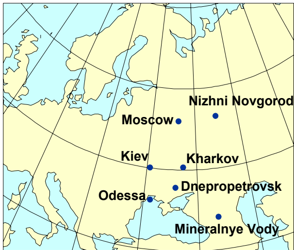
Fig. 1. Locations of the airports in European Russia and Ukraine, for which the FP conditions are studied in the paper.

December). At the other airports, FP monthly mean maxima are 1.13 (Sheremetyevo, January), 1.03 (Domodedovo, December), 1.29 (Vnukovo, January), 0.44 (Nizhni Novgorod, November), 1.35 (Kiev, December), 1.10% (Odessa). For Kharkov and Dnepropetrovsk, the maximum monthly mean occurrence frequencies derived from the available data are about 1.0% (November to January) and 1.45% (December), respectively.