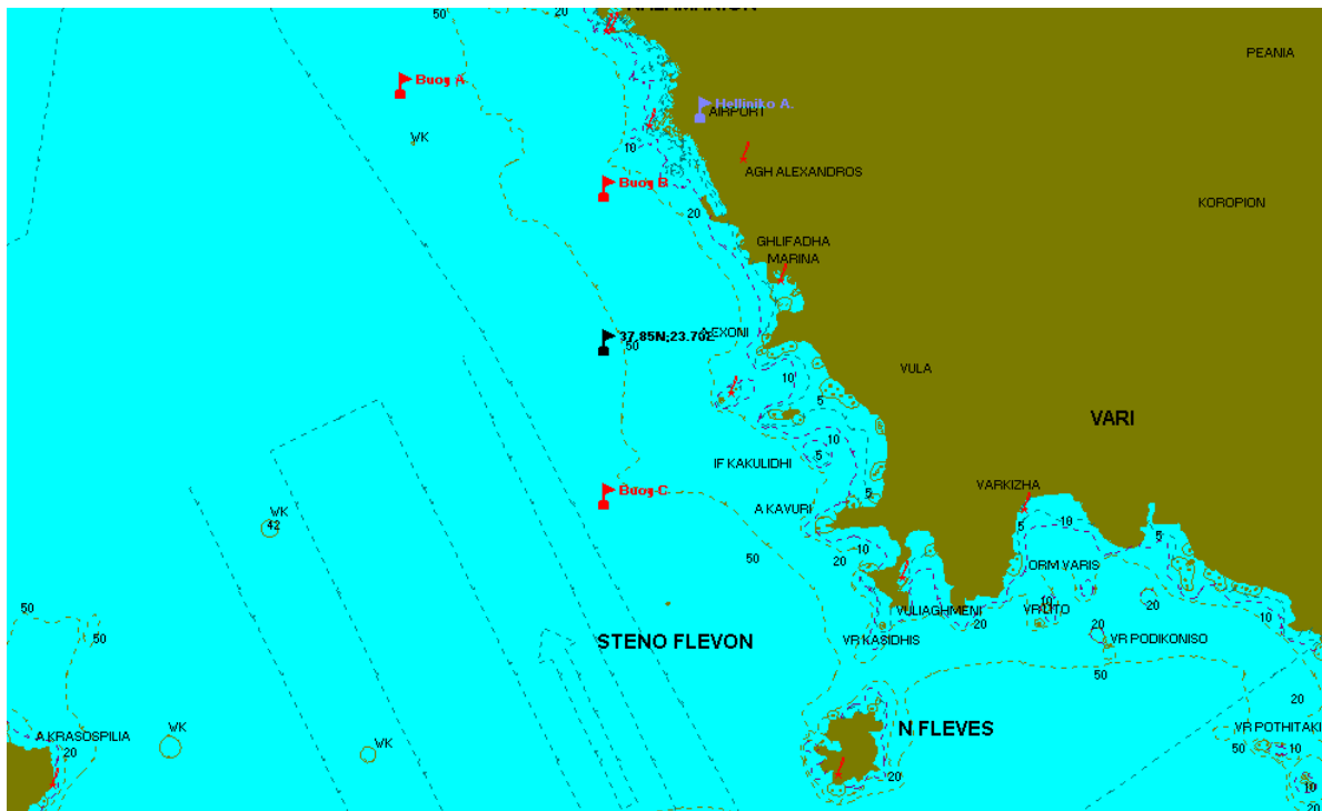
Fig. 2. Position of the Helliniko Airport AWS and the buoys in the Saroniko Gulf.

on the Peloponnesian arrives, the wind turns S and become stronger.