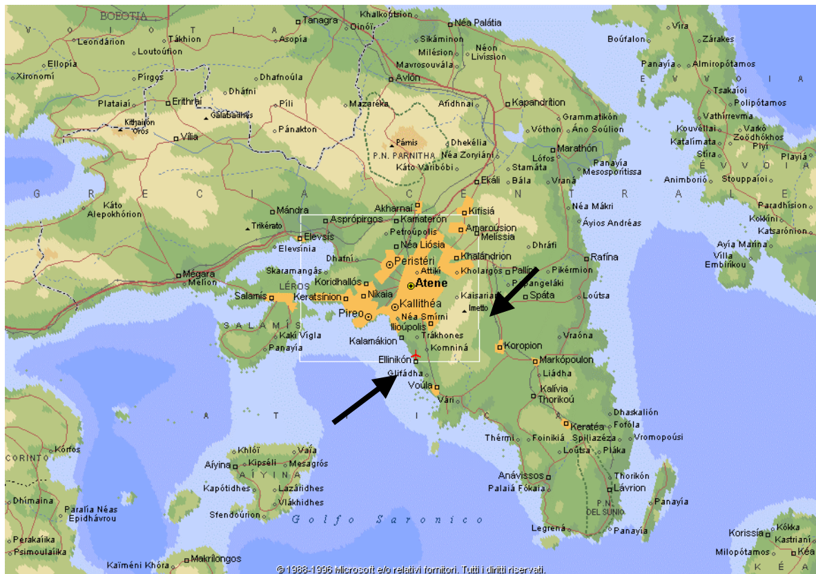
Fig. 1. Saroniko Gulf. The flags show the principal direction of the sea breeze from SW and of the Etesian wind from NE.