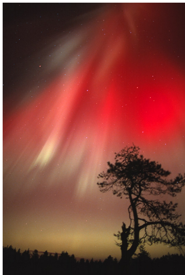
Fig. 2. Auroras in Northern Finland, 21.10.2001.