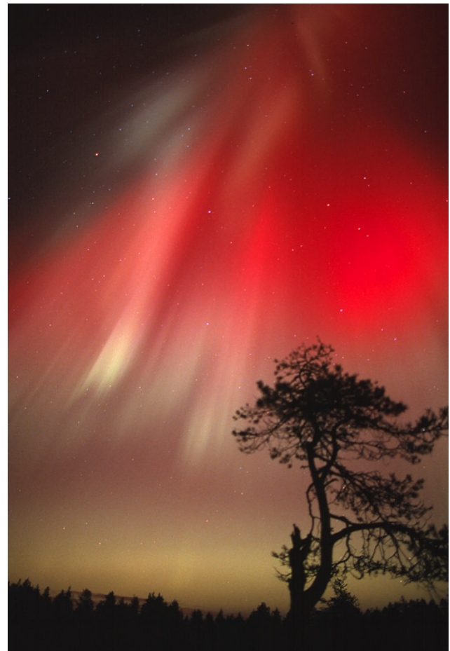
Fig. 2. Auroras in Northern Finland, 21.10.2001.