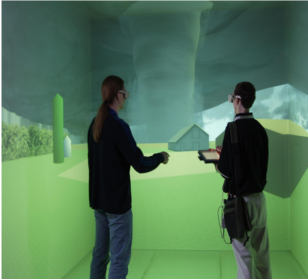
Fig. 1. Two users of the virtual storm, nearing the tornado within the CAVE™ environment.