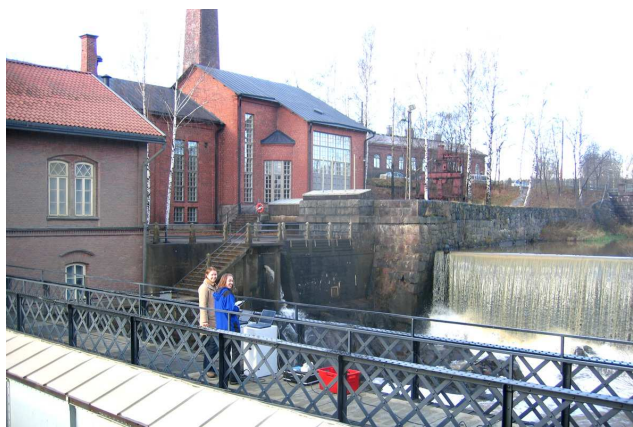
Fig. 1. The Vanhankaupunginlahti barrage with two happy measurers. The AIS took measurements from the bridge. The reference measurement point was about 100 m to the right (East) of the bridge. The closest road is located behind the building in the middle of the picture.