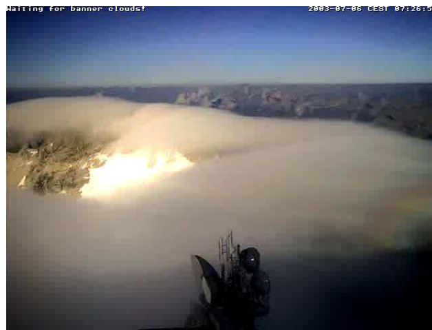
Fig. 5. Example of a cap cloud at mount Zugspitze from 6 July 2003 07:26. Wind blowing from the west i.e. from right to left. Wind speed at Zugspitze summit is 7.4 m/s at 280°. The radio sounding of Munich from 6 July 2003 00:00 UTC shows a Brunt-Väisälä frequency of 0.011 \text{ s}^{-1} .

We now present selected movie sequences in order to illustrate and discuss various aspects of our definition. Figures 4 through 10 show still images taken from these movies. In the caption below every still image there appears the name of the appropriate movie in the supplementary file http://www.atmos-chem-phys.net/7/2047/2007/acp-7-2047-2007-supplement.zip . To view these movies refer to Appendix A. Inside the movie the actual time (Central European Time = local average solar time + 12 min) is shown in the top right corner. This time and the frame number are used to refer to specific events within the sequences. The captions include information about wind speed and direction measured at the weather station right on the Zugspitze summit. Additionally the Brunt-Väisälä frequency N is given, which was determined from an appropriate nearby radio sounding: either from Innsbruck located 35 km to the south-east, or from Munich/Oberschleissheim located 80 km to the north-east, depending on which was available, which was closer in time, and which better represented the meteorological situation shown in the movie. The Brunt-Väisälä frequency N = \sqrt{g\theta^{-1}d\theta/dz} was calculated from finite differences between 700 hPa and 750 hPa.