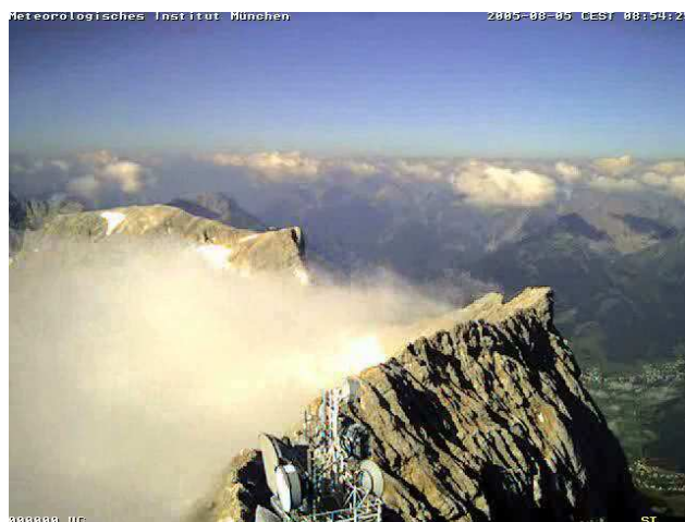
Fig. 7. Still image of movie m07.mpg from 5 August 2005 8:34–9:14, an example for a banner cloud transforming into a convective cloud. Wind blowing from the north i.e. from right to left. Wind speed at Zugspitze summit is 3.2 m/s at 10^\circ . The radio sounding of Innsbruck from 5 August 2005 03:00 UTC shows a Brunt-Väisälä frequency of 0.0041 \text{ s}^{-1} . For the movie see supplemental material: http://www.atmos-chem-phys.net/7/2047/2007/acp-7-2047-2007-supplement.zip and Appendix A.

Fig. 6 shows an ambiguous example. Based on the movie it is hard to conclude whether we are dealing with a banner cloud or not. Although the wind speed is very low (about 2 m/s), the initial development resembles that of a banner cloud: fog forms on the Zugspitzplatt and is drawn towards the ridge (9:46, frame 0 to 9:56, frame 110) where it is caught and turned over in the lee vortex. But then condensation starts on the windward side, too, and a lifting cloud forms covering the whole ridge. One may argue that the cloud formation on the windward side is not connected to the cloud on the leeward side and that the cloudy air from the windward side simply obscures the view onto the banner cloud. In this sense criterion I is satisfied and the cloud could be classified as a banner cloud. But apparently there is no spatial separation between the two clouds. The cloudy air from the windward side does not simply obscure the view, it merges with the banner cloud. The cloud as a whole does not resemble a banner cloud any more. Nevertheless we can not rule out that parts of this cloud still form due to upward motion in the lee.