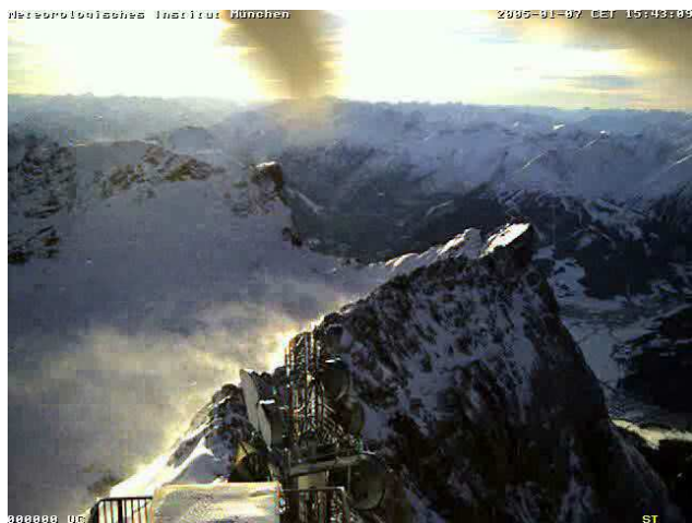
Fig. 10. Still image of movie m10.mpg from 7 January 2005 15:50–16:11, an example for snow blown off the mountain. Wind blowing from the north i.e. from right to left. Wind speed at Zugspitze summit is 9.0 m/s at 350°. The radio sounding of Munich from 7 January 2005 12:00 UTC shows a Brunt-Väisälä frequency of 0.0122 \text{ s}^{-1} . For the movie see supplemental material: http://www.atmos-chem-phys.net/7/2047/2007/acp-7-2047-2007-supplement.zip and Appendix A.