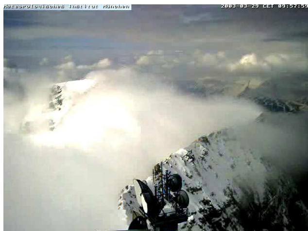
Fig. 6. Still image of movie m06.mpg from 29 March 2003 09:46–10:19, an ambiguous case. Wind blowing from the north i.e. from right to left. Wind speed at Zugspitze summit is around 1.5 m/s at 340^\circ . The radio sounding of Innsbruck from 29 March 2003 03:00 UTC shows a Brunt-Väisälä frequency of 0.0095 \text{ s}^{-1} . For the movie see supplemental material: http://www.atmos-chem-phys.net/7/2047/2007/acp-7-2047-2007-supplement.zip and Appendix A.

ridge and is accordingly convex. Additionally its top appears much smoother than the banner clouds presented here indicating stable stratification.