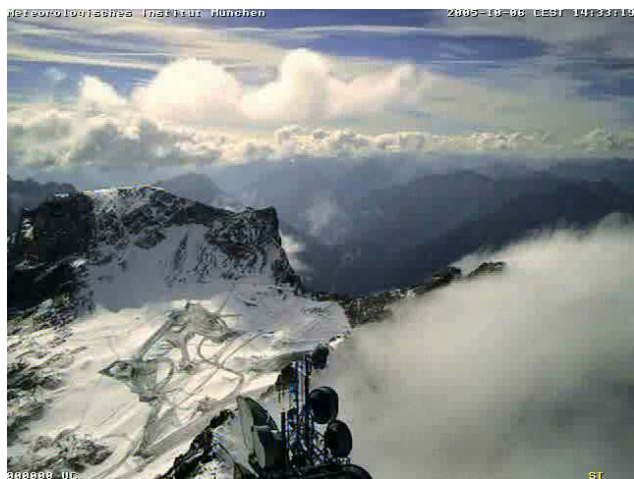
Fig. 8. Still image of movie m08.mpg from 6 October 2005 14:07–16:22, a case with different condensation levels. Wind blowing from the south i.e. from left to right. Wind speed at Zugspitze summit is 8.0 m/s at 150°. The radio sounding of Innsbruck from 7 October 2005 03:00 UTC shows a Brunt-Väisälä frequency of 0.0144 \text{ s}^{-1} . For the movie see supplemental material: http://www.atmos-chem-phys.net/7/2047/2007/acp-7-2047-2007-supplement.zip and Appendix A.