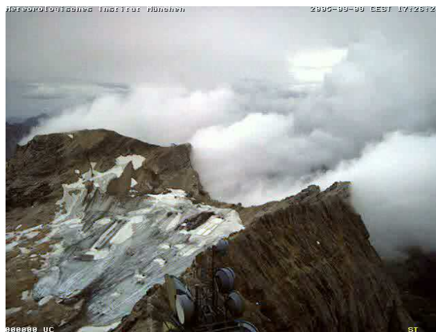
Fig. 9. Still image of movie m09.mpg from 9 September 2005 17:01–18:07, an example for convective clouds transforming into a banner cloud. Wind blowing from the south east i.e. from left to right. Wind speed at Zugspitze summit is 5.0 m/s at 140°. The radio sounding of Munich from 9 September 2003 12:00 UTC shows a Brunt-Väisälä frequency of 0.0057 \text{ s}^{-1} . For the movie see supplemental material: http://www.atmos-chem-phys.net/7/2047/2007/acp-7-2047-2007-supplement.zip and Appendix A.

The definition of the LCL assumes forced lifting and excludes mixing of the air parcel with the surrounding air. Condensation occurs at the level where the lifted parcel saturates.