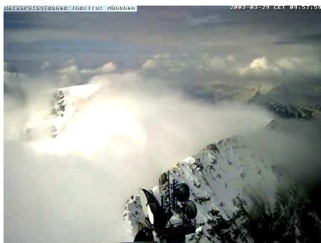
Fig. 6. Still image of movie m06.mpg from 29 March 2003 09:46–10:19, an ambiguous case. Wind blowing from the north i.e. from right to left. Wind speed at Zugspitze summit is around 1.5 m/s at 340^\circ . The radio sounding of Innsbruck from 29 March 2003 03:00 UTC shows a Brunt-Väisälä frequency of 0.0095 \text{ s}^{-1} . For the movie see supplemental material: http://www.atmos-chem-phys.net/7/2047/2007/acp-7-2047-2007-supplement.zip and Appendix A.

ridge and is accordingly convex. Additionally its top appears much smoother than the banner clouds presented here indicating stable stratification.