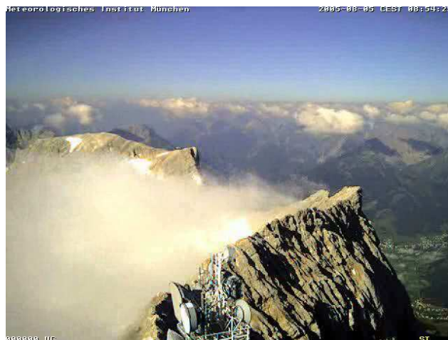
Fig. 7. Still image of movie m07.mpg from 5 August 2005 8:34–9:14, an example for a banner cloud transforming into a convective cloud. Wind blowing from the north i.e. from right to left. Wind speed at Zugspitze summit is 3.2 m/s at 10^\circ . The radio sounding of Innsbruck from 5 August 2005 03:00 UTC shows a Brunt-Väisälä frequency of 0.0041 \text{ s}^{-1} . For the movie see supplemental material: http://www.atmos-chem-phys.net/7/2047/2007/acp-7-2047-2007-supplement.zip and Appendix A.

Fig. 6 shows an ambiguous example. Based on the movie it is hard to conclude whether we are dealing with a banner cloud or not. Although the wind speed is very low (about 2 m/s), the initial development resembles that of a banner cloud: fog forms on the Zugspitzplatt and is drawn towards the ridge (9:46, frame 0 to 9:56, frame 110) where it is caught and turned over in the lee vortex. But then condensation starts on the windward side, too, and a lifting cloud forms covering the whole ridge. One may argue that the cloud formation on the windward side is not connected to the cloud on the leeward side and that the cloudy air from the windward side simply obscures the view onto the banner cloud. In this sense criterion I is satisfied and the cloud could be classified as a banner cloud. But apparently there is no spatial separation between the two clouds. The cloudy air from the windward side does not simply obscure the view, it merges with the banner cloud. The cloud as a whole does not resemble a banner cloud any more. Nevertheless we can not rule out that parts of this cloud still form due to upward motion in the lee.