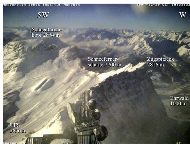
Fig. 2. Field of view of the camera with directions and the main landmarks.

which is folded and skirts the ridges of the peaked mountain (rather than being straight, as above for the two-dimensional horizontal ridge). The confluence associated with this folded vortex tube is at least partly compensated by upwelling in the lee of the mountain. In a vertical section through the axis of symmetry this secondary circulation follows the dashed line in Fig. 1. Because argument B works for three-dimensional peaked obstacles only, Geerts (1992a) restricted his definition to peaked mountains.