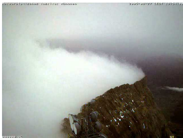
Fig. 4. Still image of movie m04.mpg from 27 August 2005 19:07–20:20, an example for a typical banner cloud. Wind blowing from the north i.e. from right to left. Wind speed at Zugspitze summit is 3.8 m/s at 10°. The radio sounding of Munich from 28 August 2005 00:00 UTC shows a Brunt-Väisälä frequency of 0.0096 \text{ s}^{-1} . For the movie see supplemental material: http://www.atmos-chem-phys.net/7/2047/2007/acp-7-2047-2007-supplement.zip and Appendix A.