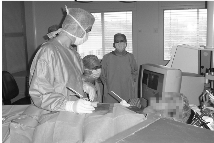
Figure 1. Our CASPER application in use.

In CAS systems, Augmented Reality (AR) interaction techniques are based on the fusion of two worlds: the digital world (e.g., MRI, scan images, computed trajectory) and the real world (e.g., the patient's body, a needle). However, there is no consensus on a definition of AR techniques highlighting the problem of delimitating the frontier between the two worlds [2] [7]. As we defined in [2], the adapters are devices in charge of the fusion between the two worlds. We distinguish input adapters (inputs to the system) from output adapters (outputs from the system). The input adapters, such as an electro-magnetic localizer or a video camera, capture information from the real world that is transferred to the computing system, while the output adapters, such as a projector or a Head Mounted Display (HMD), convey information from the digital world to the real world. The results of the fusion thanks to the output adapters are either perceived in the digital world (e.g., a 3D brain model and a video of a patient merged on a screen [5]) or in the real one (e.g., a 3D model projected onto the patient's body [1] [4]). For example, using CASPER, a computer-assisted pericardial puncture application, the surgeon must look at the screen to get the guidance information, as shown in Figure 1.