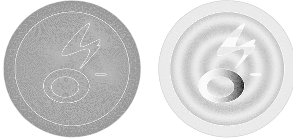
Figure 2: Perfect reconstruction test. From left to right, the initial guess, the reconstructed conductivity after three iterations

Figure 2 shows the result of the reconstruction when perfect measurements (with 'infinite' precisions) are available. We use two different Dirichlet boundary data, g_x = 2 + x/6 and g_y = 2 + y/6 . In the first approach proposed in Section 3.1, this is implemented by alternating the procedures with g_x and g_y . In the optimal control approach, this corresponds to simply adding the contribution of both correctors. In both cases, the boundary data are positive, which implies the positivity of u in the domain \Omega . The initial guess is depicted on the left: it is equal to 1 everywhere. The right picture represents the reconstructed conductivity after three iterations. A 7 digit accuracy in L^2 norm and in L^\infty norm is reached after five iterations.