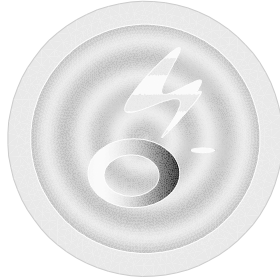
Figure 1: Conductivity Distribution.

three zones where the conductivity is notably different: An area with an irregular boundary where the conductivity is a piecewise constant function \text{int}(8/10 \cos(4y) + 9/10) + 1/10 , where \text{int} is the integer part function, a small stretched ellipse with constant conductivity 1/10 , and an annulus where the conductivity increases rapidly (x + 2)^2 + 0.1 . The purpose of choosing this pattern is to demonstrate that the reconstruction methods are very effective for a large variety of conductivities. The conductivity distribution is presented on the Figure 1. The simulations are done using the partial differential equation solver FreeFem++ [7].