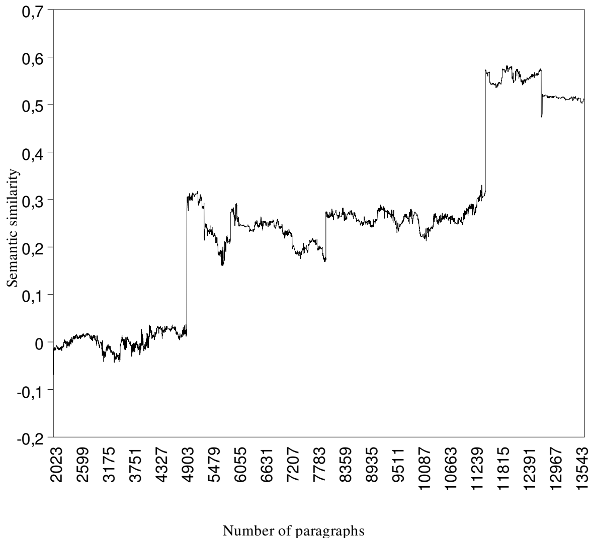
Figure 2. Similarity between acheter (buy) and magasin(shop) according to the number of paragraphs.

For each pair of words, we partitioned out the gains of similarity among the different categories. For instance, if the similarity between X and Y was .134 for the 5,000- paragraph corpus and .157 for the 5,001- paragraph corpus, we attributed the .023 gain in similarity to one of the five previous categories. We then summed up all gains for each category. Since the sum of the 11,637 gains