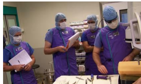
Figure 1. One participatory observation experiment: Designers are in the operation room discussing with the surgeon. Surgeons acts are being captured by an eye-tracker and a general camera.

Than a collective design process is a PD activity where all the actors are considered as experts and their participation are based on their knowledge. In this case of collective design, the designers and the users don't use