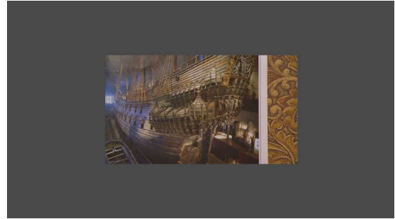
Fig. 3. Example of a SD image inserted in a HD image.

SD broadcast qualities. They have been chosen to be representative of an excellent ( Q_{80} ) and of a rather good ( Q_{60} ) subjective visual quality, respectively. It means to get scores of around 80 and 60 on a continuous subjective quality scale of 1 to 100. Selected bitrates are given in Table 1. These will be compared to the seven different HD quality levels. To avoid screen flickering and screen’s manual switching between HD and SD, SD videos have been inserted at the center of an HD video with gray background. An example of a SD image inserted in a HD image is presented in Figure 3.