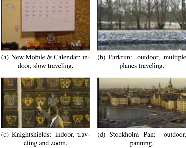
Fig. 1. Example of HDTV sequences usable for test protocol.