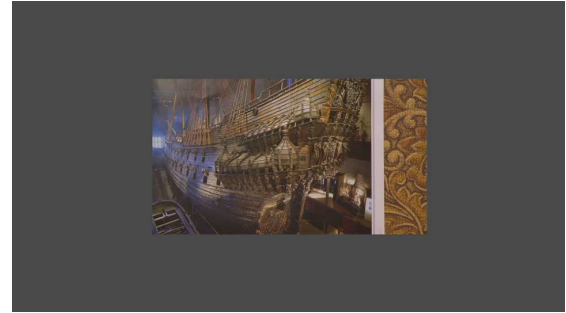
Fig. 3. Example of a SD image inserted in a HD image.

SD broadcast qualities. They have been chosen to be representative of an excellent ( Q_{80} ) and of a rather good ( Q_{60} ) subjective visual quality, respectively. It means to get scores of around 80 and 60 on a continuous subjective quality scale of 1 to 100. Selected bitrates are given in Table 1. These will be compared to the seven different HD quality levels. To avoid screen flickering and screen’s manual switching between HD and SD, SD videos have been inserted at the center of an HD video with gray background. An example of a SD image inserted in a HD image is presented in Figure 3.