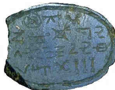
Fig. 1 : Egypte, lapis-lazuli. Ouroboros (ὄφρακων οὐροβόρος) enclosing charaktères . Kelsey Museum (Ann Arbor, Michigan, U.S.), n° 26052. 28

Numerous charaktères are shown in Hans Dieter Betz’s edition of Greek Magical Papyri in translation 27 . The two pictures reproduced here give some examples of this sort of signs. By metonymie, phylacteries alike could be called charaktères , as it can be seen in the second excerpt below (Basil of Caesarea).