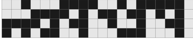
Figure 1: Partial space-time diagram of the (\mathbb{Z}_2, +) rule

in dimension 2 and more, whereas designed as Turing-universal are Intrinsically Universal by the simple fact that they are designed to encode any boolean circuit.