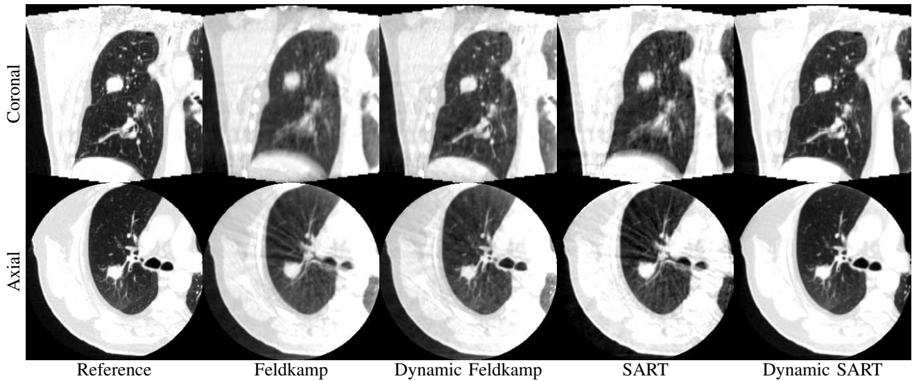
Fig. 3. Coronal and axial slices of the reconstruction results on the realistic digital phantom of the thorax. Feldkamp and SART methods do not take into account the motion. Dynamic Feldkamp uses a heuristic compensation of the motion during the backprojection step of Feldkamp algorithm. Dynamic SART is identical to the SART method with the projector taking into account the motion.

Journal of Optical Society of America A , vol. 1, no. 6, pp. 612–619, 1984.