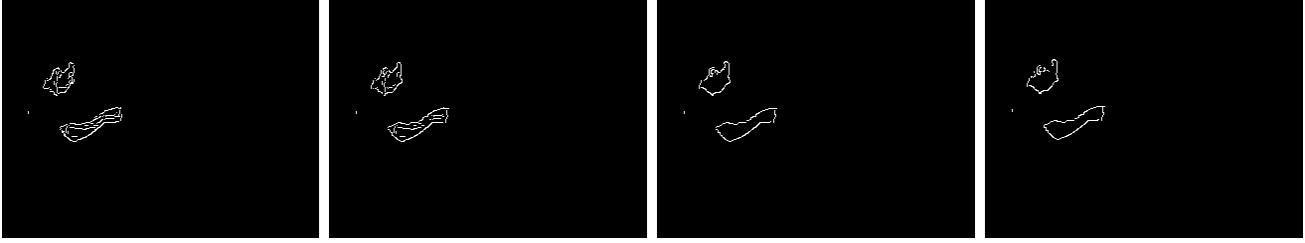
Fig. 4 Color/temperature edge detections for different values of \nu . From left to right: \nu = 0.001, 10, 30, 100

The main difference with the framework developed in Sec. 3 is that a nD image takes now the following form