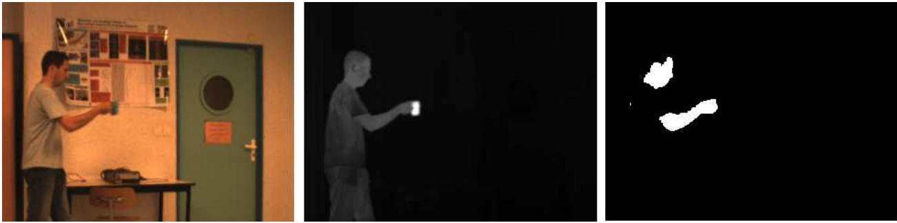
Fig. 3 left and center: color and temperature information of the scene - right: regions where g_1 = 1 in white