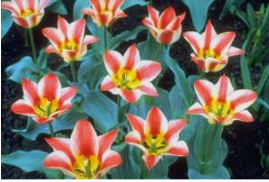
Fig. 1 Original image