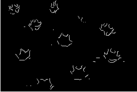
Fig. 2 Edge detection in the hue interval Red-Yellow