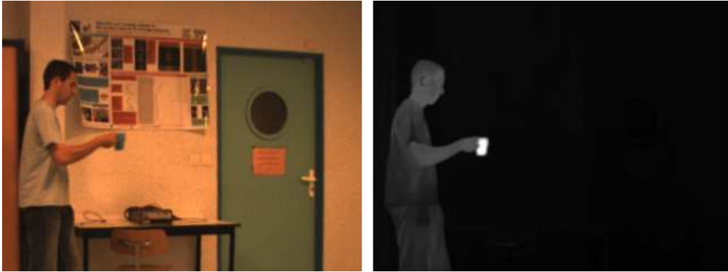
Fig. 3 Color and temperature information of the scene