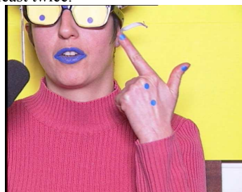
Figure 2: Image of the speaker.

The data was obtained from a video recording of a speaker pronouncing and coding in French CS a set of 267 sentences, repeated at least twice.