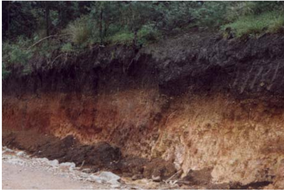
Figure 2: Superposition of a thick, black organic horizon above ‘lateritic’ material, forming the typical Nilgiri Andisols near Avalanche (11°17’56”N, 76°35’57”E, 2100 m). This polygenetic and polycyclic profile constitutes a bisequum. Profile description (also valid for NILG 4, see Tables 1, 2 and 3) — 0-20 cm: dark reddish-brown (5 YR 3/2, moist), mull type humus, crumbly structure, very friable, smooth boundary; 20-55 cm: dark reddish-brown (5 YR 2.5/2, moist), clay loam, friable to very friable, many fine roots, smooth boundary; 55-65 cm: gravelly transition horizon (stone line), dark reddish-brown (5 YR 3/3, moist), sandy clay with 50 to 75% of coarse elements (nodules), massive structure, many fine roots, smooth boundary; 65-110 cm and deeper: dark red (2.5 YR 3/6, moist), clay loam with pseudoparticles, massive structure, roots, very friable (moist) to hard (dry), very porous (microporosity).

Although it could be of a sedimentary nature (transported hillslope material related to the truncation by erosion of the underlying lateritic profile), its field characteristics rather suggest a purely pedogenetic origin reminiscent of iron-pan development. The origin and spatial distribution of this highland stone line clearly deserves further investigation.