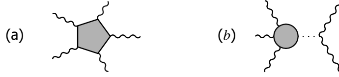
Figure 2: Contribution to the field theory limit of the five-graviton amplitude.

Working out the bosonic contractions, the integrand of the five-point amplitude in the even/even spin structure sector takes the form