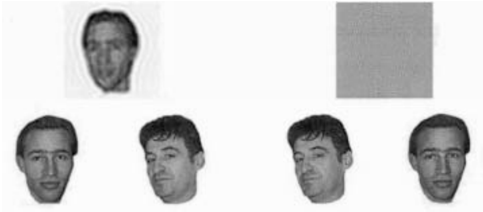
Fig. 2. Example of stimuli used in the high- (right side) and low-pass filtered (left side) condition in experiment 2.