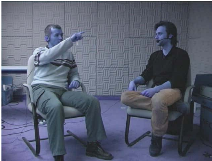
Figure 1: Introducing a physical object into the communication process by means of pointing.

et al., forthcoming 2007) that these types of movements play a role in the communication process and if a head nod may be interpreted differently from a vocal backchannel, it is nevertheless perceived as a minimal response from the interactant. Therefore, it makes sense to annotate these body movements, which are under-specified as compared to hand gestures. It may also make sense to include in the annotation physical objects present on the scene of recording and to which participants may refer to in the course of their interaction by means of deictic pointing and referential verbal expression since the physical object suddenly enters the communication process. This phenomenon occurred in our corpus as in the following example: