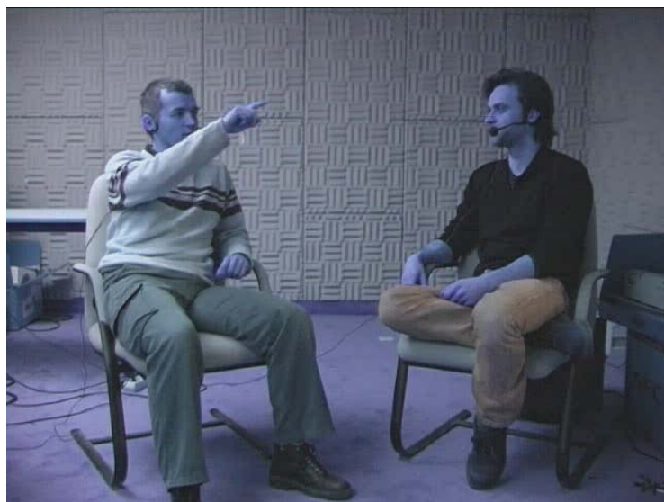
Figure 1: Introducing a physical object into the communication process by means of pointing.

et al., forthcoming 2007) that these types of movements play a role in the communication process and if a head nod may be interpreted differently from a vocal backchannel, it is nevertheless perceived as a minimal response from the interactant. Therefore, it makes sense to annotate these body movements, which are under-specified as compared to hand gestures. It may also make sense to include in the annotation physical objects present on the scene of recording and to which participants may refer to in the course of their interaction by means of deictic pointing and referential verbal expression since the physical object suddenly enters the communication process. This phenomenon occurred in our corpus as in the following example: