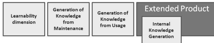
Figure 1: Generation of knowledge with an “Extended Product”.

design, manufacture, marketing, etc.... They represent somehow the power and capability of a firm. Various methods are available such as MASK, REX, MSKM, etc... to model the knowledge generated within these phases