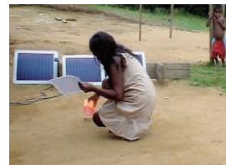
Amazonian Mundurukú villager reading a map to identify a hidden object.