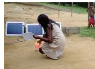
Amazonian Mundurukú villager reading a map to identify a hidden object.