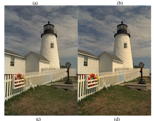
Figure 5: The four artifacts visible after demosaicing: (a) Excessive blurring (b) Grid effect (c) Watercolor (d) False color.

If the period is higher, the chrominance spectra would be located closer to the center of the spectrum, increasing the probability of aliasing between luminance and chrominance. The Bayer CFA is the only proposed CFA on a square grid that provides the same horizontal and vertical sampling frequency for each color and a maximum sub-sampling by a factor of two in the horizontal, vertical, and diagonal direction. Other proposed CFAs, such as stripes or interlaced stripes, have at least the horizontal or vertical direction sub-sampled by a factor of three. Also, the fourcolor CFA proposed recently does not provide a reduction of aliasing since its frequency pattern is identical to the Bayer and the addition of a color should reduce correlation between color channels and worsen aliasing by increasing the chrominance bandwidth. However, a CFA on a hexagonal grid should provide better reconstruction of three colors.