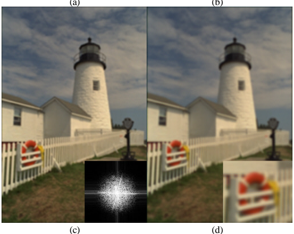
Figure 2. Example of a bilinear interpolation computed with convolution filters. (a) Original image: the frequency spectrum of the red (and green and blue) occupies most of the Fourier spectrum. (b) Reconstructed image with bilinear interpolation. (c) Low pass filtering applied to the original image to reduce the size of the Fourier spectrum of the image. (d) The reconstruction of image (c) after mosaicing according to the Bayer CFA and demosaicing by bilinear interpolation shows no artifacts.

Figure 2 illustrates this concept. In a normal three-color per pixel image (Fig. 2-a), each color channel generally has a large Fourier spectrum (Fig. 2-a inset), occupying most of the Fourier space. If we sub-sample such an image, the reconstruction would result in aliasing because the sub-