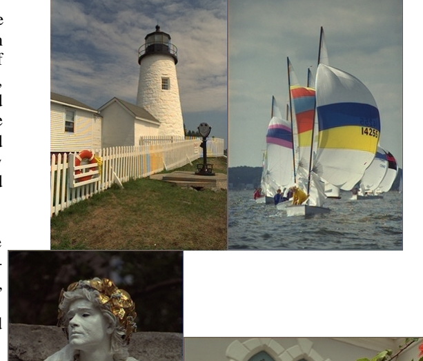
Figure 6: Results of the frequency selection demosaicing algorithm on four images. The same luminance filter (Figure 4-b) is used for the reconstruction.

designed to optimize spatial acuity and not to match as closely as possible the human luminosity function. Visual examples of images mosaiced with the modified Bayer CFA and demosaiced by frequency selection can be found in [43].